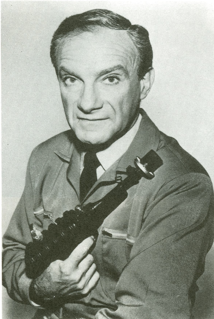
Dr. Zachary Smith is the one unexpected "guest" on the voyage. He has stowed away as a spy only to become a part of the permanent "crew" when things go awry. He is assisted by the robot.